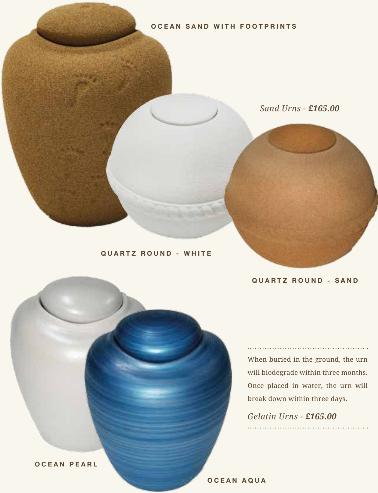
OCEAN SAND WITH FOOTPRINTS

Each urn is shipped in a box with custom protective packaging that provides families with a convenient and discreet option for transportation. The box (and urn) will pass through airport security screenings and can fit in the overhead compartment of most commercial airliners.